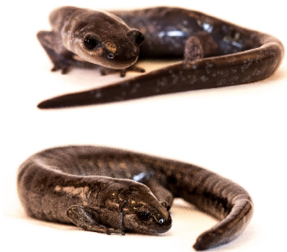
Fig. 1. Unisexual Ambystoma salamander (top) and small-mouthed salamander ( Ambystoma texanum , bottom).

County, Ohio (~200 km 2 ) during spring 2015. The mean number of individuals per site was 4.25 (range: 3–5; sites C10, C13, C22, C29) for A. texanum and seven for unisexuals (range: 6–9; sites C13, C29, C1303). All individuals were acclimated individually in a cold room kept at 13 °C and fed three adult crickets weekly for a month. In addition to sympatric unisexual and A. texanum individuals, we included two additional sympatric, sexual species, A. jeffersonianum ( N = 5 ) and A. laterale ( N = 2 ), that had been held captive in the same conditions as the wild-caught animals since 2010. Because of the potential confounding factors associated with the length of captivity (diet quality, lack of seasonality, acclimation to human interaction), we do not include these two sexual species in any statistical analysis. However, the data from A. jeffersonianum and A. laterale individuals are useful for providing a qualitative comparison in levels of endurance between the unisexuals and their parental, sexual species that constitute their nuclear genomes.